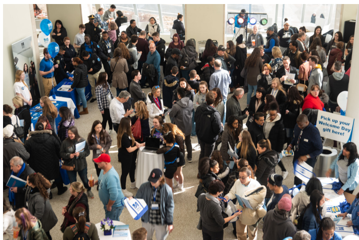
More than 1,650 admitted students and their guests came out for Welcome Day on February 23.