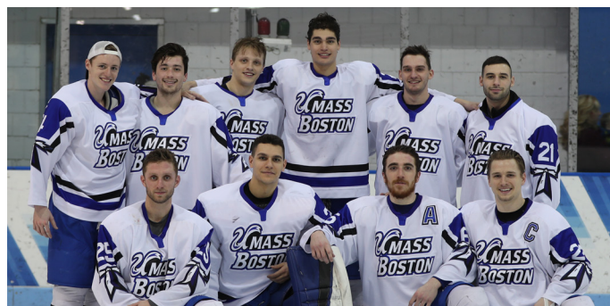
The men's hockey team earned their regular season title on Senior Night.

UMass Boston currently serves more than 650 student veterans, their family members, and guardsmen and women. The campus's Office of Veterans Affairs recruits, provides financial assistance, and guides veterans and their dependents through their higher education experience and beyond, managing $4 million in federal GI benefits.