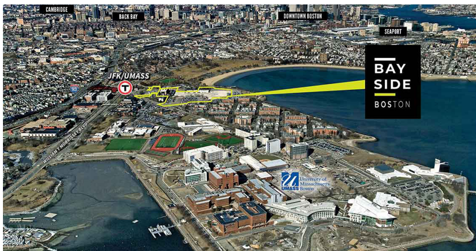
An aerial view showing the location of the Bayside Expo Center property