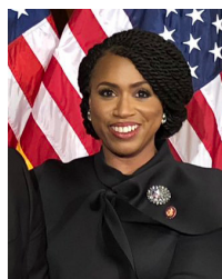
Congresswoman Ayanna Pressley