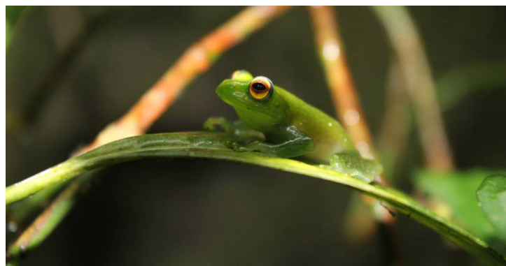
UMass Boston researchers are looking at ways to control, prevent, and fight amphibian-killing fungi.

The approximately $1.1 million grant was awarded by the Bureau of Substance Abuse Services in the Massachusetts Department of Health. INENAS and the College of Nursing and Health Sciences will partner with local tribal communities to provide life skills training to Native middle school students. The training aims to increase the students' self-esteem, decrease their stress levels, and make them more resilient in resisting drug use, including opioid use.