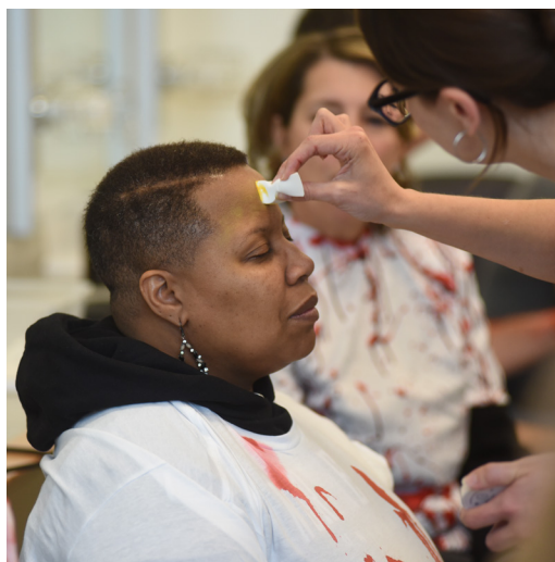
Theatre Arts students provided moulage to simulate mock injuries, providing a more realistic situation for first responders.