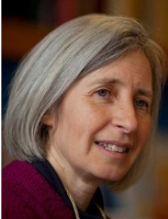
Martha Minow Doctor of Laws

Martha Minow is a renowned expert in constitutional law and human rights. Throughout her prestigious career, her work has focused on issues confronting historically marginalized individuals and groups; legal responses to social, political, and religious conflict; and legal treatments of digital communications and technologies. She currently holds the 300th Anniversary University Professorship at Harvard University, and she has taught at Harvard Law School since 1981, serving as dean for eight years (2009–2017).