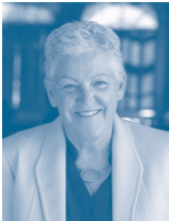
Regina (Gina) McCarthy '76 Doctor of Humane Letters

The first White House national climate advisor and former U.S. Environmental Protection Agency (EPA) administrator, Regina (Gina) McCarthy is one of the nation's most respected voices on climate change and public health. She played a key role in restoring U.S. climate leadership on the global stage.