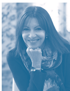
Ana Maria Hidalgo Doctor of Humane Letters

The Honorable Ana Maria Hidalgo is the first woman ever elected mayor of Paris. Serving from 2014 until March 2026, she pursued an agenda focused on family housing, inclusive public services, and environmental action. She currently serves as global ambassador of the Global Covenant of Mayors, working on climate leadership with mayors around the world.